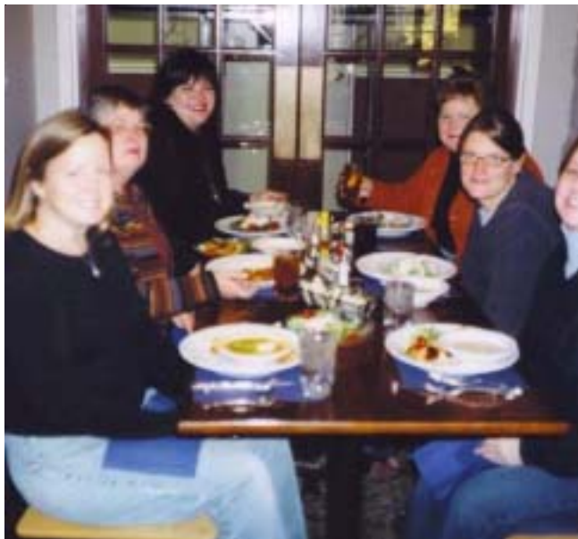
Fall 2004 Women to Women Retreat

Once a year the clergy sponsor an Inquirer's Class for those adults who wish to learn about the Episcopal faith or desire to be received into or confirmed in the Episcopal Church. Women to Women meets twice monthly and provides a regular opportunity for all the women of St. Mark's to support each other and enjoy each others' company. This intergenerational group also has an annual retreat in the fall. Neighborhood Fellowships also meet regularly for study, support, and prayer.