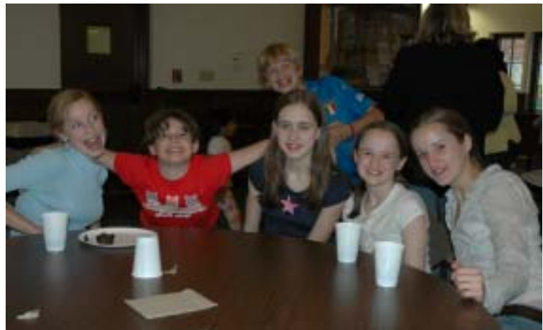
Trebles at the 2005 Choir Party

Our Treble Choir includes singers in the 4th grade and above. This group sings for services approximately once a month, and also participates in occasional diocesan festivals. Participation in the group offers learning opportunities for its members, with discussion and exploration of topics relating to the church such as bible study, saints, and liturgics.