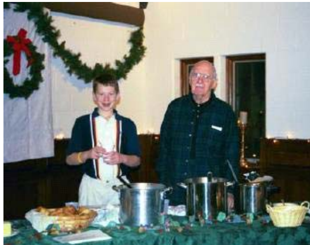
"Soup's on" at the 2004 Holiday Bazaar for the benefit of Habitat for Humanity and Glen Ellyn Youth and Family Counseling Services

Besides the official channels of M&O, the church and its members reach out beyond the parish in many ways, including: serving on the board of the diocesan Cathedral Shelter, participating in the Shelter's Christmas basket program for needy families, volunteering at PADS (a community based program for the homeless), volunteering at the Glen Ellyn Food Pantry, taking part in the community wide CROP Walk, working with Habitat for Humanity and working with the People's Resource Center. As we anticipate new clerical leadership, we look forward to invigorating our present commitments and taking on additional ones.