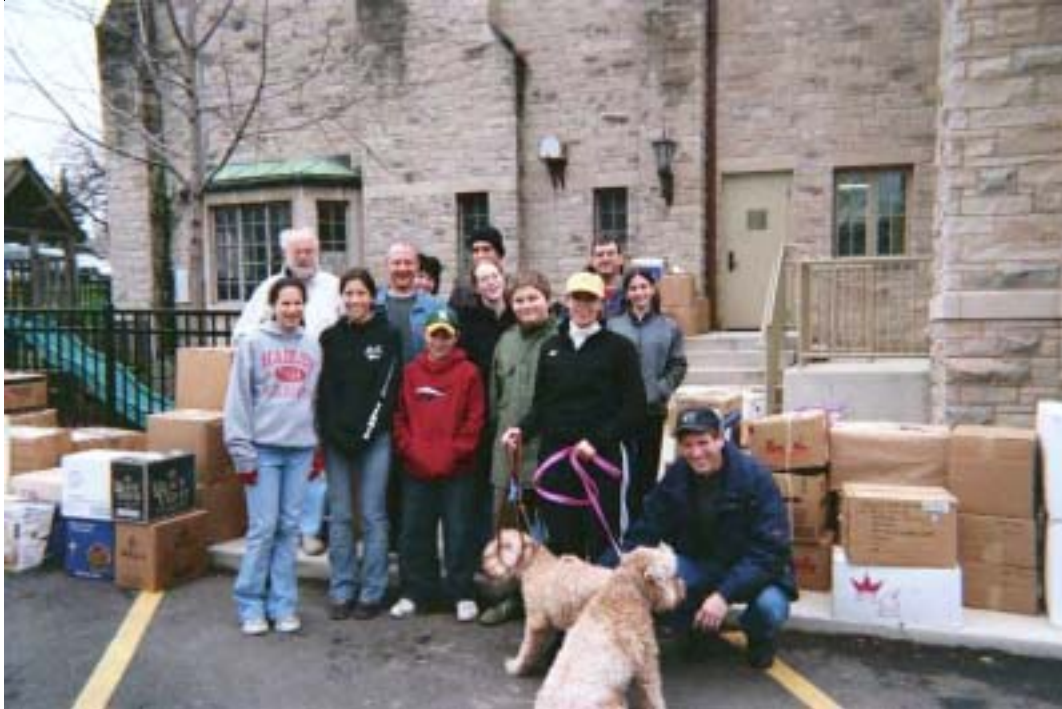
Youth from St. Mark's help load donated boxes of food and Christmas gifts into the Cathedral Shelter Truck

St. Mark's youth ministries program is called CONNECTIONS . It provides an opportunity for youth, grades 6-12, to connect with Christ, each other, the St. Mark's parish family, and the community. CONNECTIONS emphasizes Bible studies, fun, worship, and fellowship.