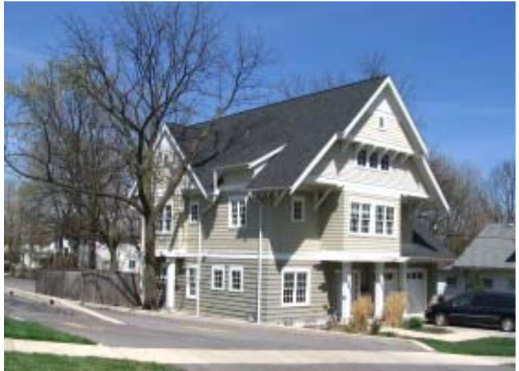
St. Mark's Rectory

St. Mark's is blessed with a beautiful and spacious rectory, completed in 2000 adjacent to the church on the location of the former curacy. This lovely home was designed in the Craftsman style to blend with the neighborhood, and the inside design continues with Craftsman simplicity. It is a home that will nurture our clergy for generations to come.