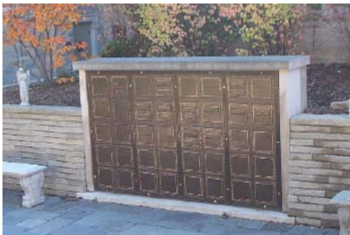
St. Mark's Columbarium

The Columbarium is located adjacent to the chapel on building grounds. It provides wall niches and ground sites for the remains of deceased parish members and their families. It also serves as a peaceful garden for prayer or meditation. The remaining grounds are beautifully landscaped and include a small playground.