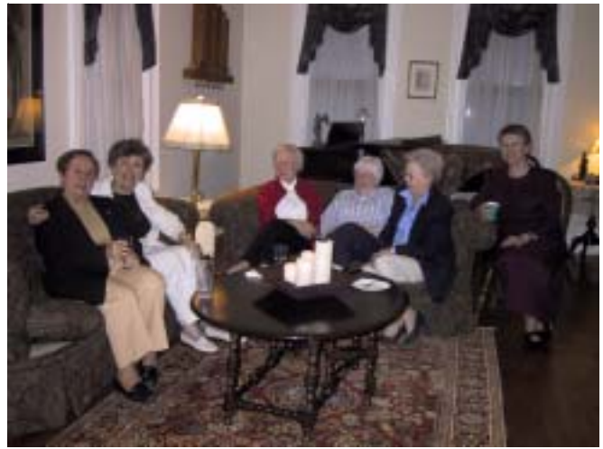
St. Mark's Daughters of the King Salad Supper, May 2005

St. Anne Chapter of the Daughters of the King currently has 30 active members and almost 70 years of history at St. Mark's. Throughout the years the service provided by the women has been as varied as the women themselves, and this tradition continues today. Many members serve the Lord by participating in the Altar Guild, others are called to funeral and wedding hospitality, and some women serve on their knees in fervent prayer.