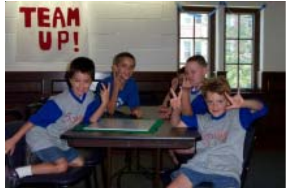
Vacation Bible School August 2004

I love the educational programs for children. They are one of the wonderful parts of St. Mark's.