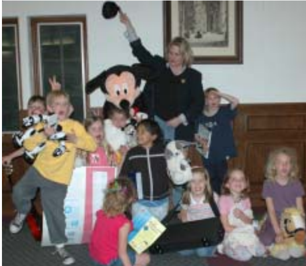
Fun at the 2005 Choir party

The Children's Choir consists of our youngest singers, those in grades 1 through 3. Under the leadership of the Children's Choir Director, the children rehearse weekly and sing for Sunday services several times a year.